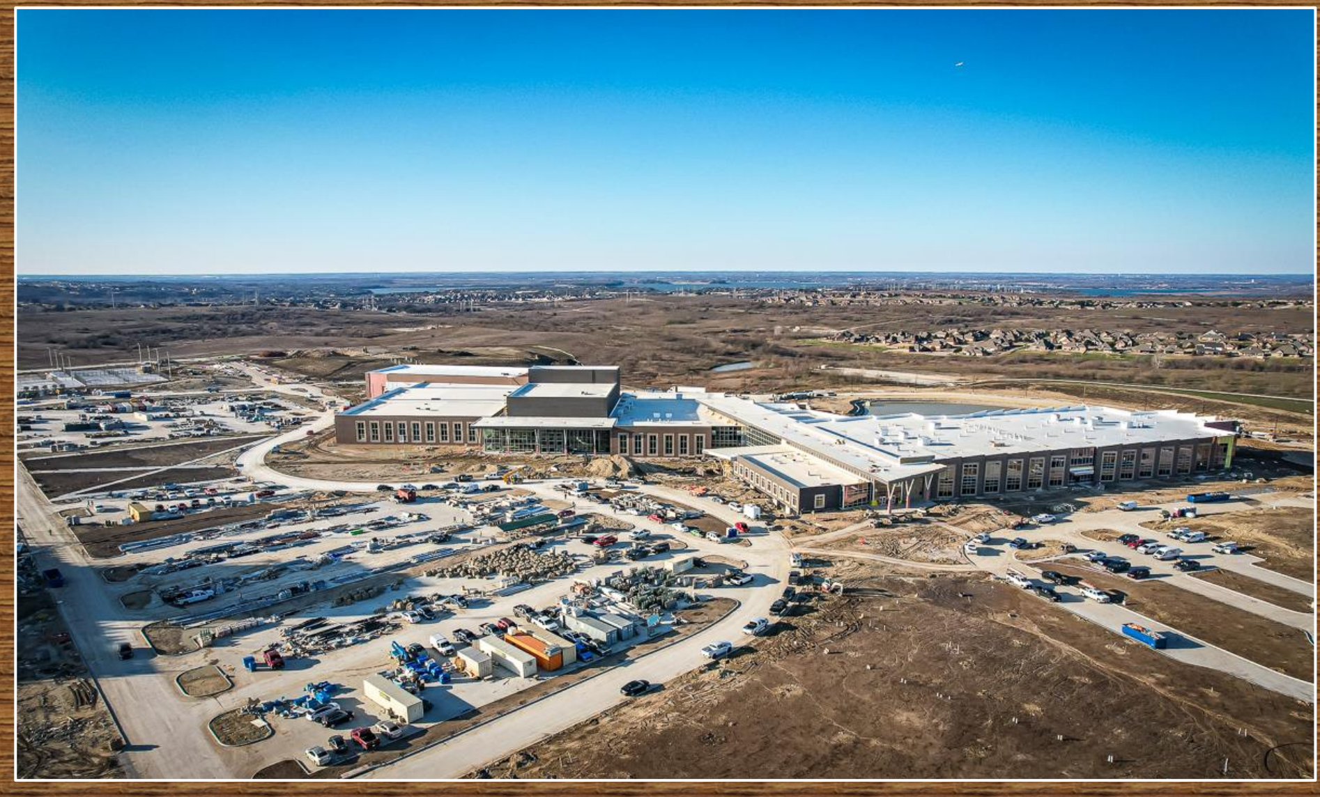
Northern side of campus facing south.